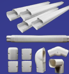
Line Cover Kit