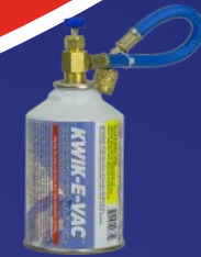
Line Set Flushing Kit