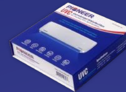
UVC Bacterial Disinfection Kit